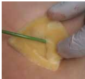
Provides 6 day antimicrobial barrier protection against CRBSI

Following catheterization, achieving hemostasis with manual compression can be time-consuming and costly. Patients are also at increased risk for catheter-related blood stream infections (CRBSI) 1 . The Clo-Sur PLUS P.A.D. antimicrobial dressing accelerates hemostasis and protects against nosocomial infection.